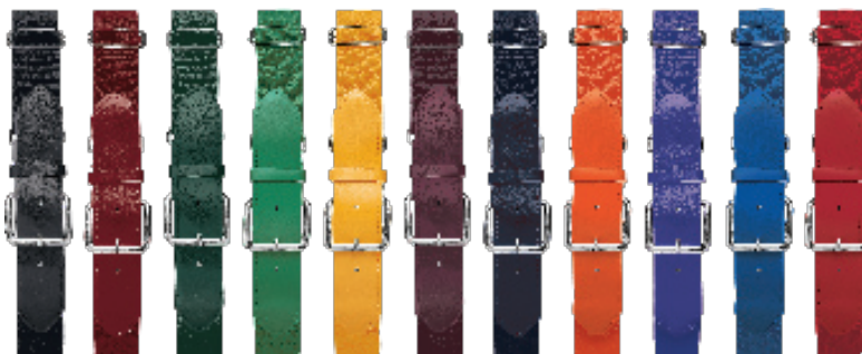
Black 080 Cardinal J36 Forest 038 Kelly 030 Lt Gold 178 Maroon 045 Navy 065 Orange 029 Purple 050 Royal 060 Scarlet 083