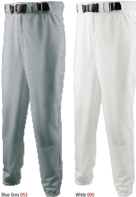
Blue Grey 053