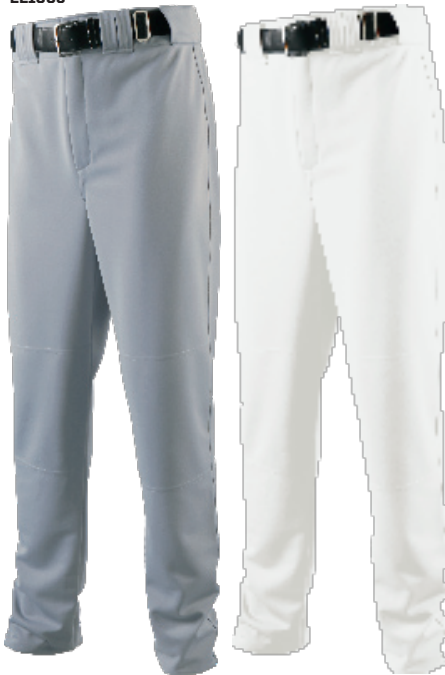
Blue Grey 053