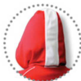
Back of hood