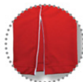
Side zipper detail