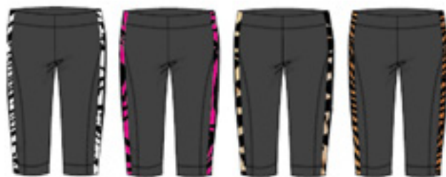
160 Zebra 699 Fuchsia Zebra 187 Leopard 163 Tiger

ALL ITEMS SOLID BLANK. DECORATION IS OPTIONAL, UNLESS OTHERWISE NOTED