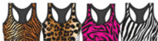
163 Tiger 187 Leopard 699 Fuchsia Zebra 160 Zebra